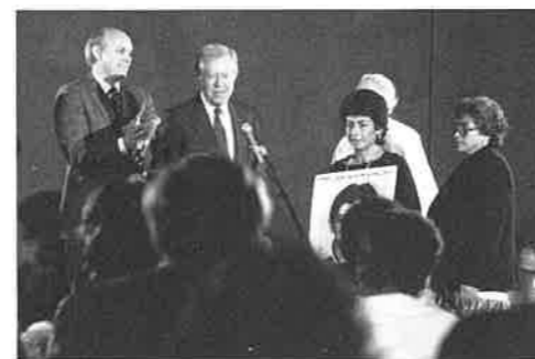
Grupo de Apoyo Mutuo, Guatemala (co-recipient)

Soviet physicist and dissident Yuri Orlov founded the Moscow Helsinki Committee in May 1976. His outspoken criticism of the Communist party and human rights activism led to his expulsion from the party in 1956 and arrest in 1977. Dr. Orlov spent seven years in a strict regimen labor camp and two years in exile in Siberia before being released and moving to the United States. In 1987, he accepted a position in the Physics Department at Cornell University and continues his human rights activities as honorary chair and spokesperson for the International Helsinki Federation for Human Rights.