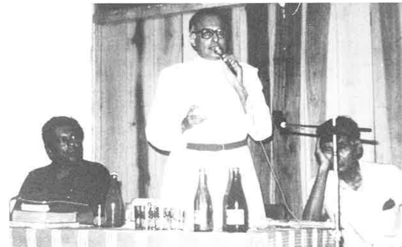
The late Bishop Lakshman Wickremasinghe, founding member and former chairman of CRM, speaks at a CRM public meeting on Torture in Sri Lanka (1982).

The Indo-Lanka agreement and the deployment of Indian troops also provoked a violent political reaction from a large section of the Sinhalese. These hostile sentiments were the background against which the JVP, the group responsible for the abortive 1971 insurgency, mobilized support with anti-Indian and anti-Tamil slogans and launched a violent campaign against the government. It sought to overthrow the state by assassinating thousands of state employees and members of the government party. The JVP also killed many members of the democratic opposition (particularly those who supported the concept of a political resolution to the ethnic conflict based on regional autonomy for the Tamil people), as well as ordinary citizens who cast their votes at elections or otherwise failed to comply with JVP-