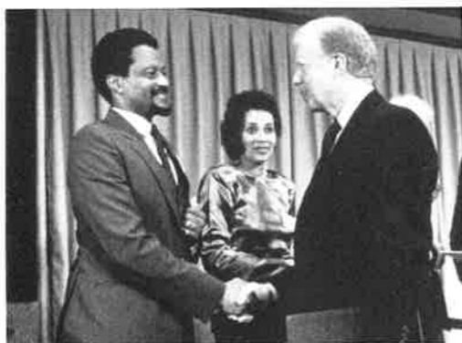
The Sisulu Family, South Africa