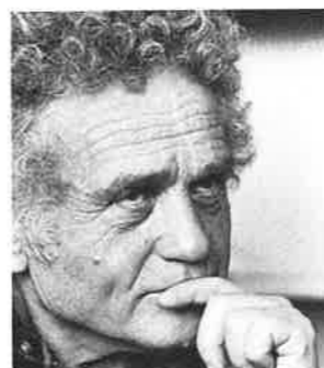
Yuri Orlov, Soviet Union (co-recipient)