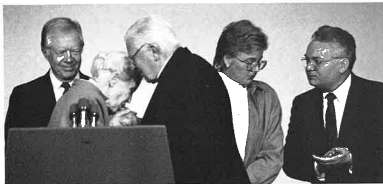
La Vicaría de la Solidaridad, Chile