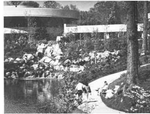
The Carter Center

The Carter Center in Atlanta, Georgia is a non-profit public policy institute founded in 1982. The Center is home to a consortium of organizations that unite research and outreach programs in an effort to improve quality of life around the world.