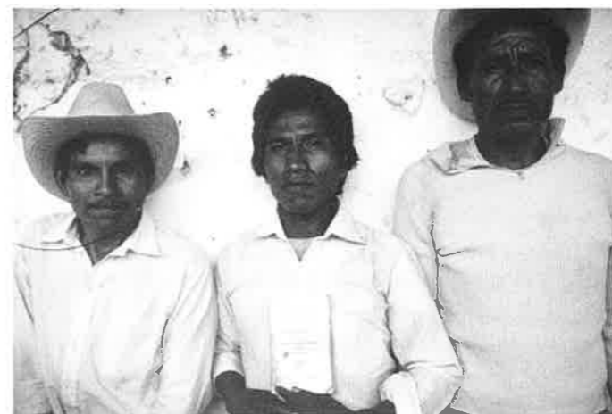
Three CERJ members display a copy of Guatemala's Constitution which guarantees them the right to refuse service in self-defense organizations such as the civil patrols.